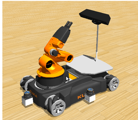
Fig. 2. Kinect

Kinect Computer Vision is the most important sensor, detecting markers, graspable objects and areas is of high importance for the robotic system. The great advantages of this system is the wide range of people currently using the Kinect and the big amount of frameworks and SDKs. The resolution of the depth-camera is 640x480px at 30fps with a 11-bit depth resolution which makes it to our preferred depth-camera. A color-camera with a resolution of 640x480px at 30fps with a 8-bit color resolution is also embedded. These characteristics fit our needs for image-processing.